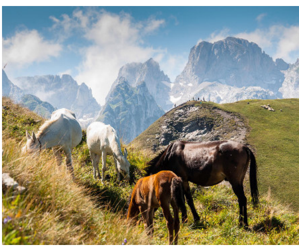
Prokletije Mountain

The European Green Belt runs along more than 12.500 km and connects 24 countries from the Barents Sea at the Russian-Norwegian border along the Baltic Coast, through Central Europe and Balkans all the way down to