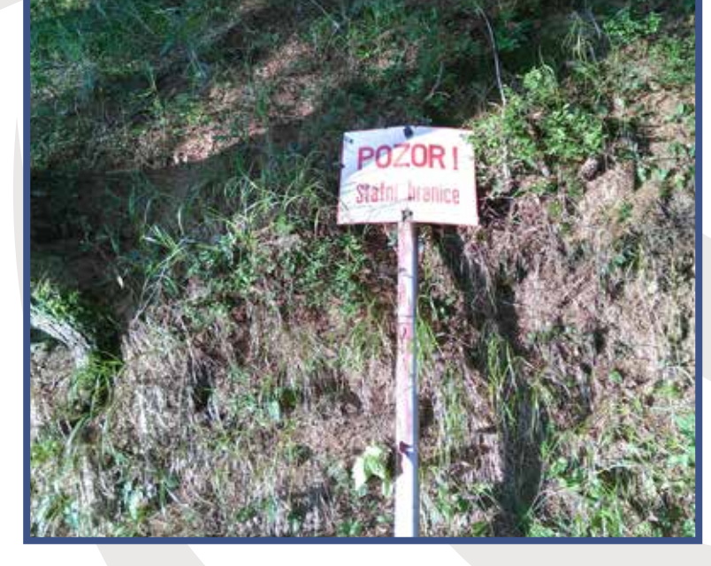
Fallen border-sign at czech-german border