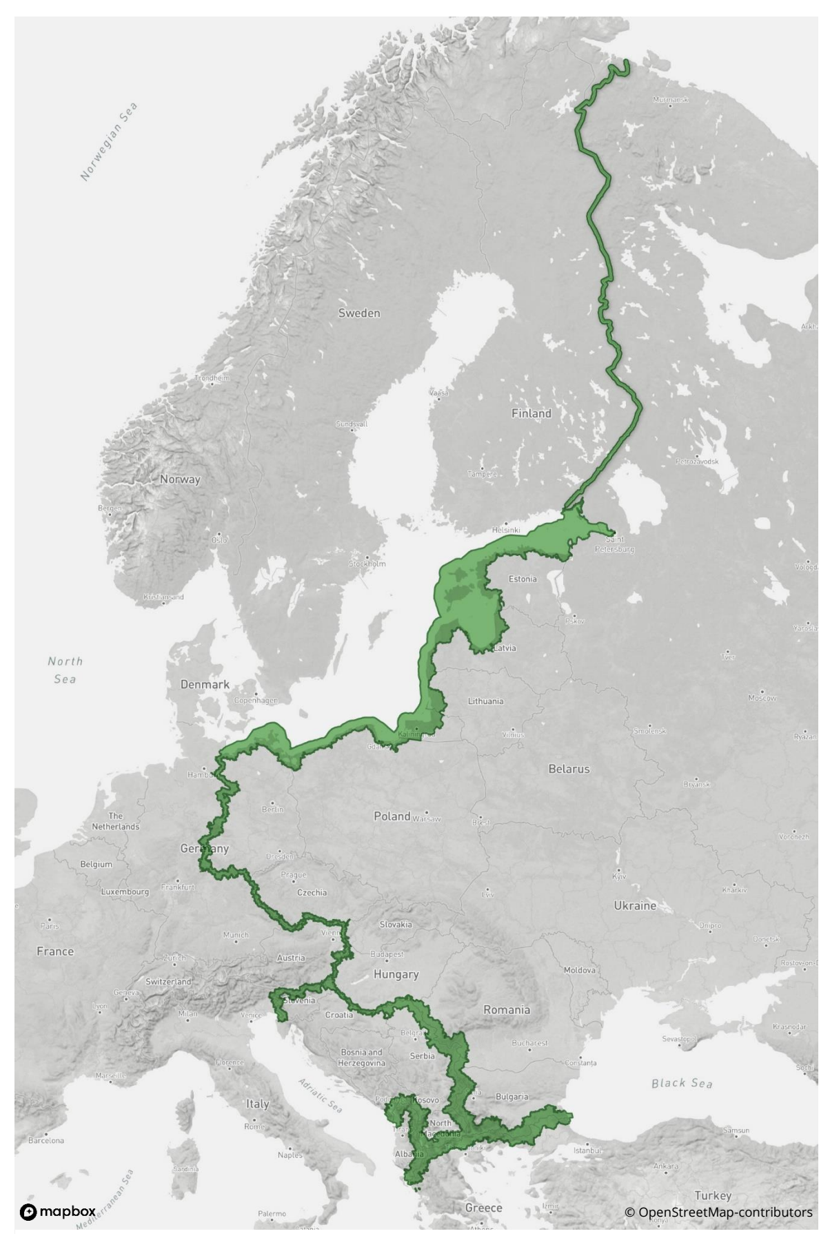
Figure 1: Indicative spatial reference area of the European Green Belt, defined by the European Green Belt Association (EGBA). The northern part of the reference area (Fennoscandia) is under preparation. For the BESTbelt project, the area is defined as 100 kilometres (km) of the border for Norway and Finland, and 5 km on the costal water.